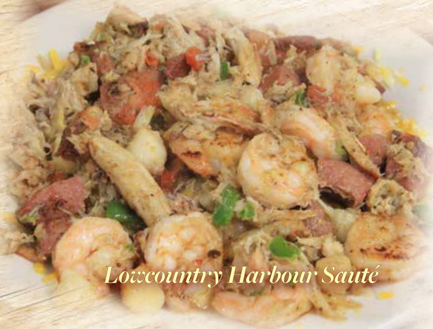
Lowcountry Harbour Sauté