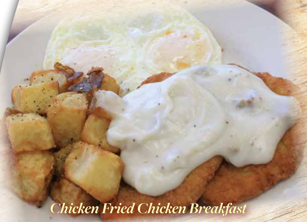
Chicken Fried Chicken Breakfast

Served with two eggs any style, patch potatoes and choice of toast – 17