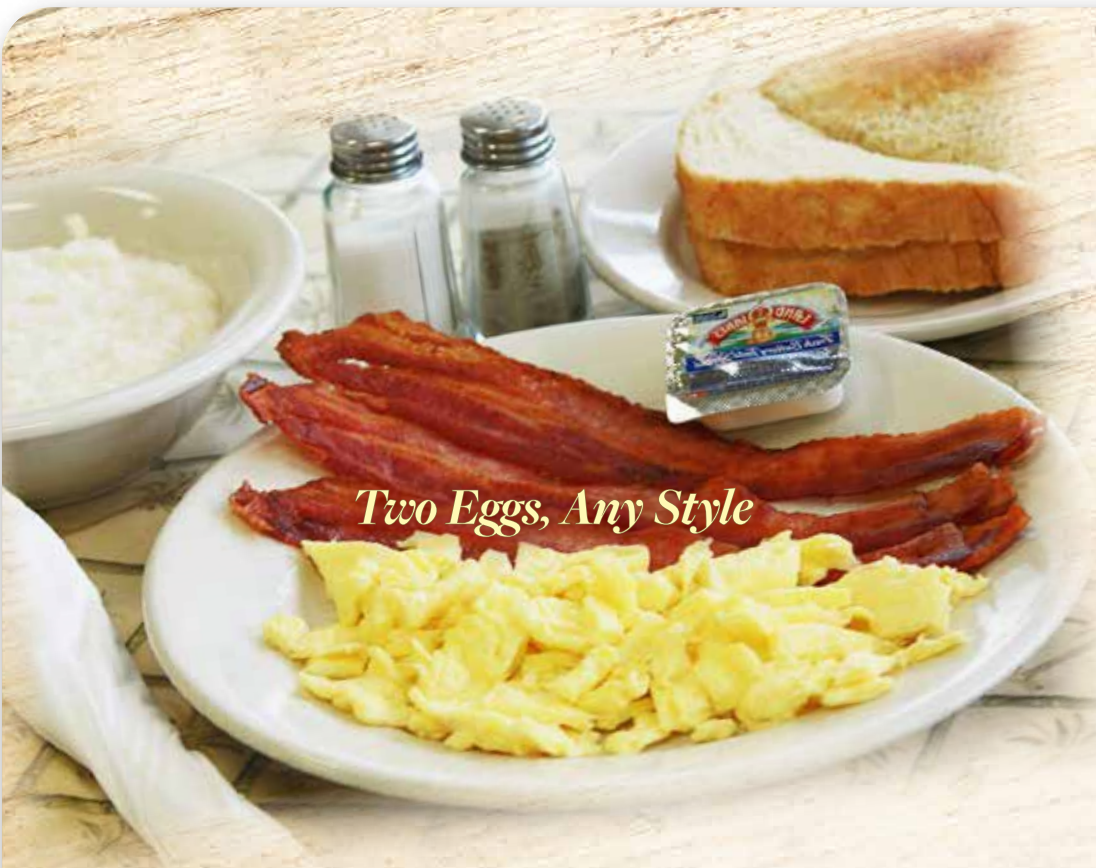
Two Eggs, Any Style