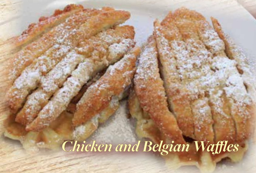
Chicken and Belgian Waffles

Smoked sausage, shrimp, crab, scallops, peppers, tomatoes and cheese on top of a bowl of grits. Served with choice of toast – 34